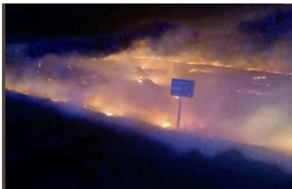
Wildfire Claggan 2025

The following evening and weekend, we also had fires in Letterkeen near the very popular Letterkeen Trailhead and camping area.