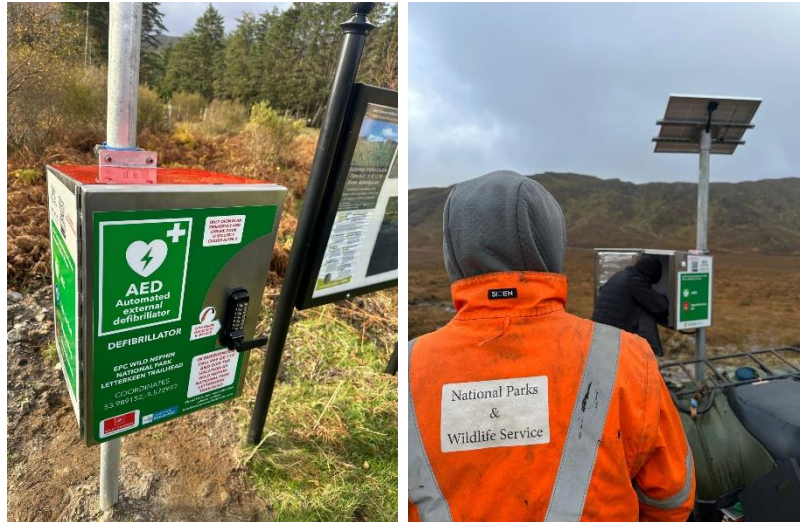
Defib Cabinets installed by NPWS General Operatives

Each cabinet is made of Stainless Steel with a rubber seal, making them weather/salt and storm proof. The solar powered cabinets do not require access to a power supply and can safely store life-saving medication as well as the defibs for use in a cardiac emergency.