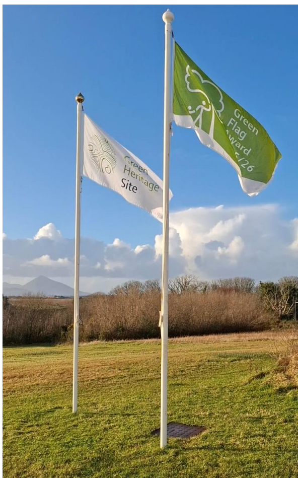
Green Flag and Green Heritage Site Flags 2025/2026 on a beautiful Ballycroy morning!

Wild Nephin National Park also collected a Green Heritage site award for the amazing work that has been carried out restoring the old cottages throughout the park so visitors and hikers can avail of these shelters that are reminders of the rich history of the area.