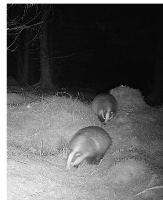
Images from the 2024 Snapshot Europe Project (L-R) Pine Marten/Cat Crainn/ Martes martes , Red Deer/Fia Rua/ Cervus elaphus and Bradger/Broc/ Meles meles