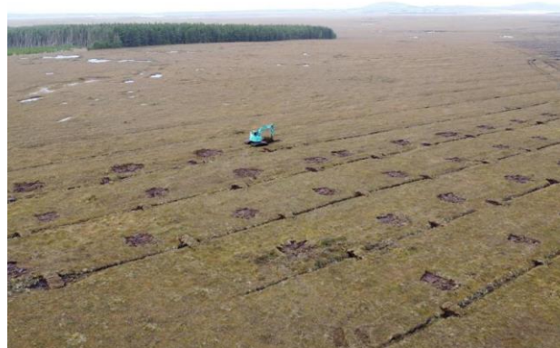
Peat dam construction across historic drains to slow the water flow Bangor Erris Bog Natural Heritage Area

The higher ground in the NHA was dammed first, then the lower ground, until the water table was restored. Characteristic bog species; sphagnum moss, sundew, heather and bog cotton have returned. A total of 1800 acres have been restored in collaboration with private landowners and the Wild Atlantic Nature Life Project.