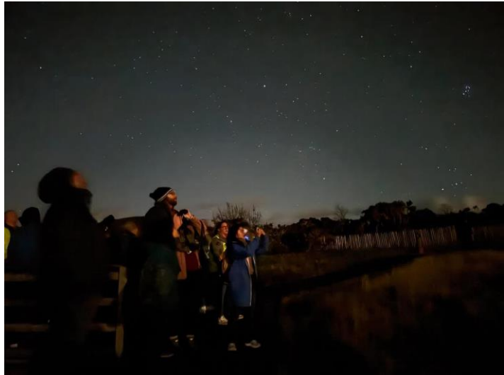
Dark Sky Park Viewing at Ballycroy Visitor Centre

ALAN 2025 brought together global leaders, researchers, and lighting experts from over 40 countries to discuss impacts of artificial light at night and explore sustainable solutions for a brighter-and darker- future. These international delegates shared their expertise in their respective fields, but also had an opportunity to experience the award-winning Mayo Dark Sky Park and the famous Irish hospitality that Westport and Mayo are celebrated for.