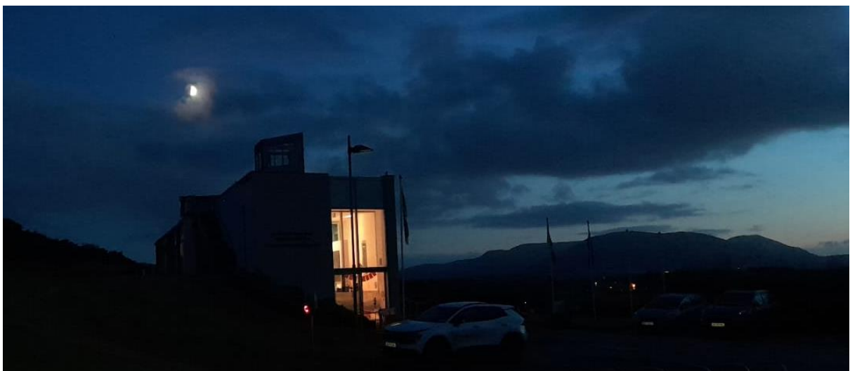
Ballycroy Visitor Centre during the Mayo Dark Sky Festival

The highlight of the weekend activities in Ballycroy was the rambling house experience in the nearby Ballycroy Community Centre that saw friend's new and old, gather together in an evening of music song and fun.