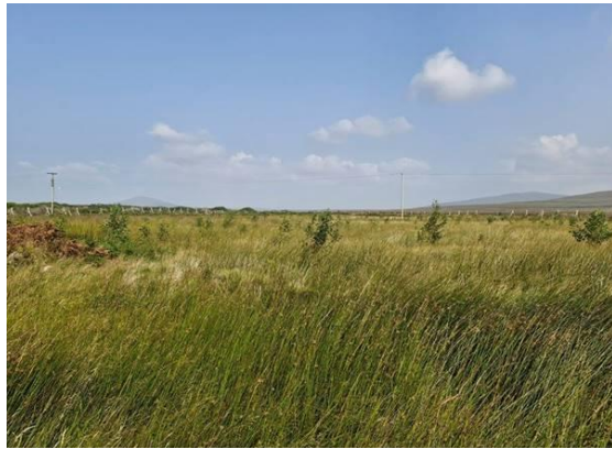
Native Woodland Scheme Enclosure Srahduggaun

of its long-term detrimental impacts, has recently lead to an urgent requirement for Rhododendron removal all across Ireland including the affected Owenduff/Nepin Complex SAC. Wild Nephin National Park has carried out management of the invasive at Ballycroy Visitor Centre, Srahduggaun, Claggan, Bellacorick, Vary's Loop and the Western Way.