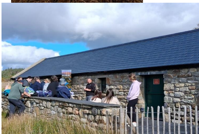
Selection of Photos from Solstice & Equinox Plant Walks to Art Installations - Images M. Gavaghan and N. O’Flynn