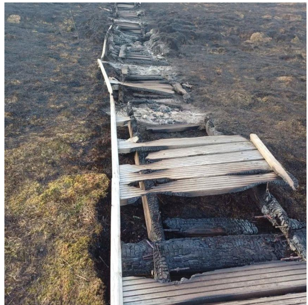
Claggan Boardwalk

The Claggan Mountain Coastal Trail was a very popular trail with over 12,000 visitors in 2024 and it was an amenity where we could deliver educational visits to schoolchildren and the public whilst also been a family friendly safe, accessible trail with breath-taking views of the mountains and coast.