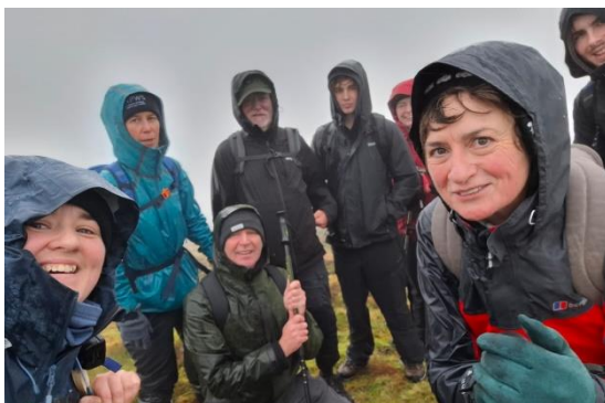
Selection of Guided Walks 2025 Images M Gavaghan