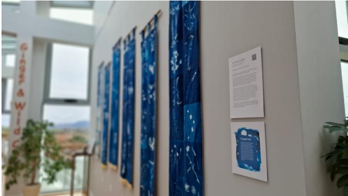
Flower Féilire Project currently on display at Ballycroy Visitor Centre

flora & fauna and linking local history and culture. The project linked in with the equinoxes and solstices over the years.