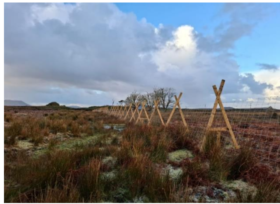
A frame deer proof fencing

Some areas that have been successfully treated, such as the 9 acre site at Srahduggaun (pictured above) have had three A-frame deer proof enclosures constructed by our General Operatives.