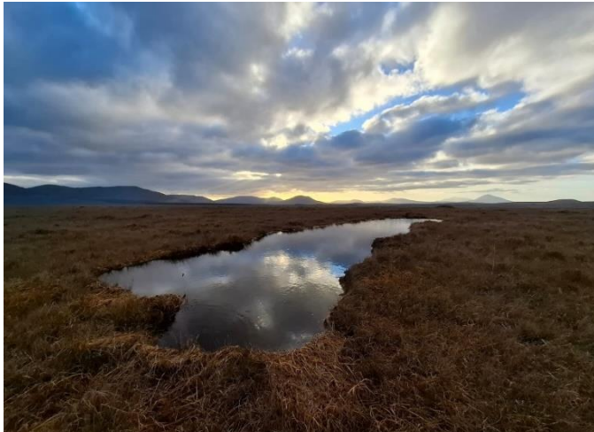
Natural Bog Pool - Owenduff/Nephrin Complex SAC