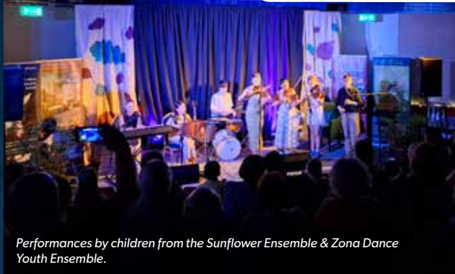
Performances by children from the Sunflower Ensemble & Zona Dance Youth Ensemble.